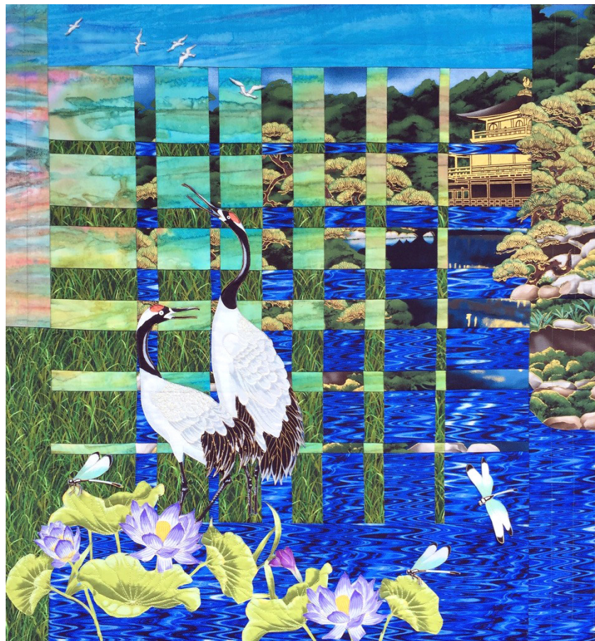
Janice Jones, Water Garden , textile art, 30 x 29 in.

Reception: September 23, 2023 from 1 - 3 pm