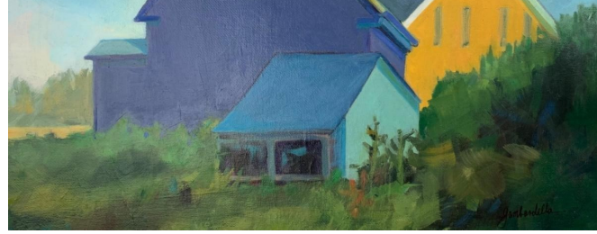
Overlooking the Park, Rockport, Teri Gambardella

run from November 16, 2019 to January 25, 2020 . An opening reception will be held on Saturday, November 16, from 2 to 4 pm in the Parker Gallery .