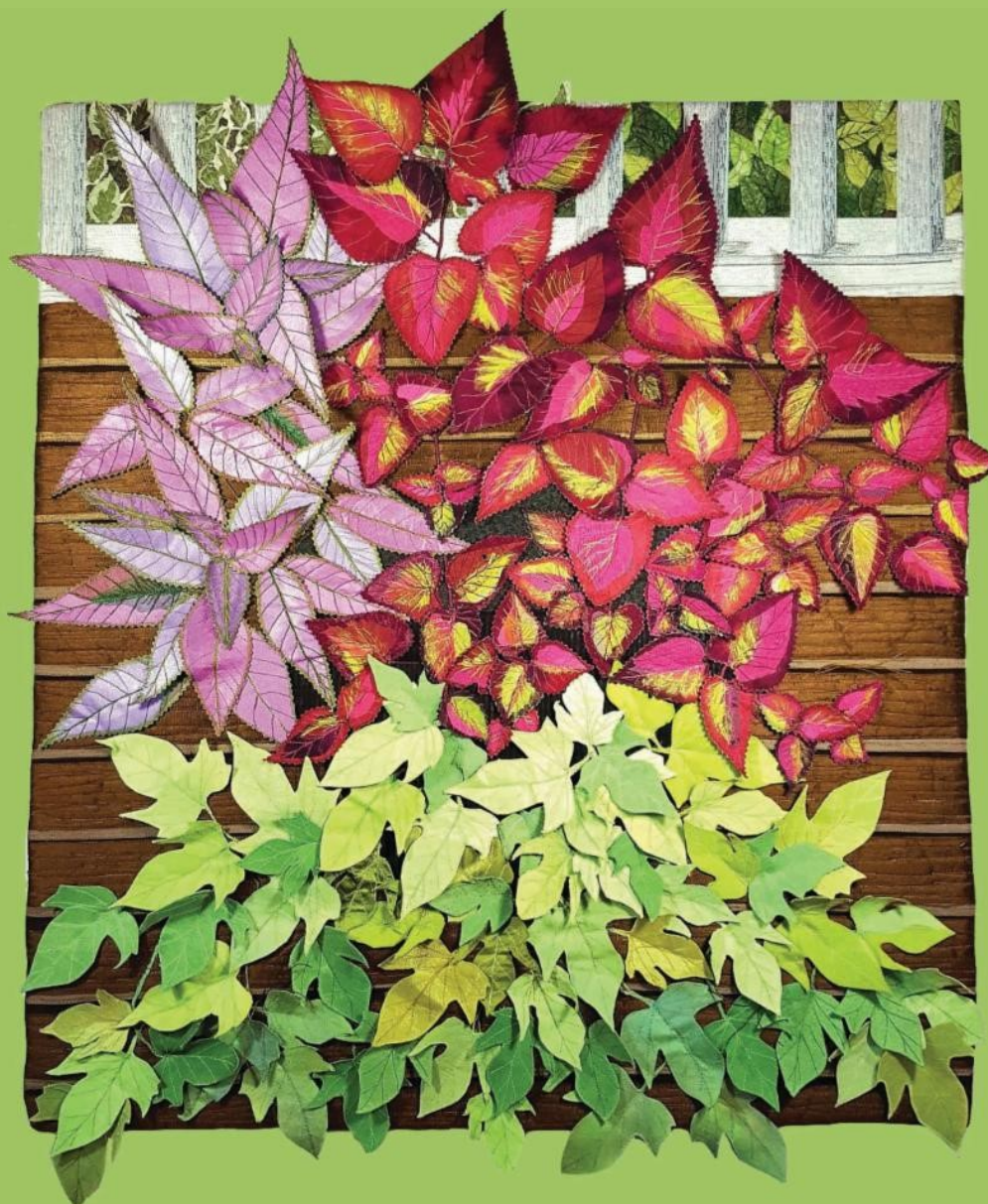
Sue Colozzi, Summer Planter , 31 x 38 in.

The Whistler House Museum of Art Announces New Exhibition: Fiber Fusions: A Juried Quilt Exhibition