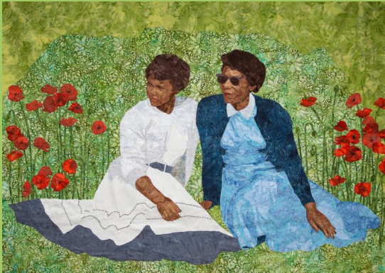
Maggie Dillon, Poppy Picnic , 42 x 59 in.

The WHMA welcomed contemporary quilts of all kinds, colors, and subject under the theme of Fiber Fusions , allowing all fiber artists to showcase their strongest work. As with all art; composition, color, and design are important towards the creation of a finished work of art. In this exquisite exhibition, fiber and other materials fuse together, through the integration of creative skills and imagination, presenting the artistic expression of each individual art quilter.