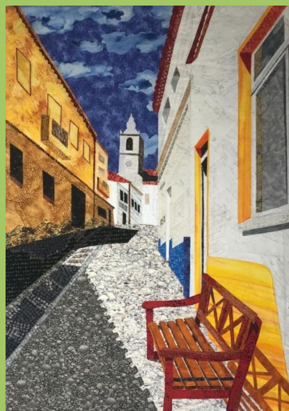
Bobbie Sullivan, High Noon, Lagos, Portugal , 34 x 24