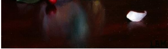
Lynne B. Mehlman, Joyous Reflections , 8 x 10 in, Oil