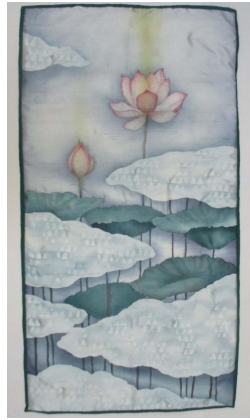
Kirenada Sterling Benjamin The Clouds of Unknowing