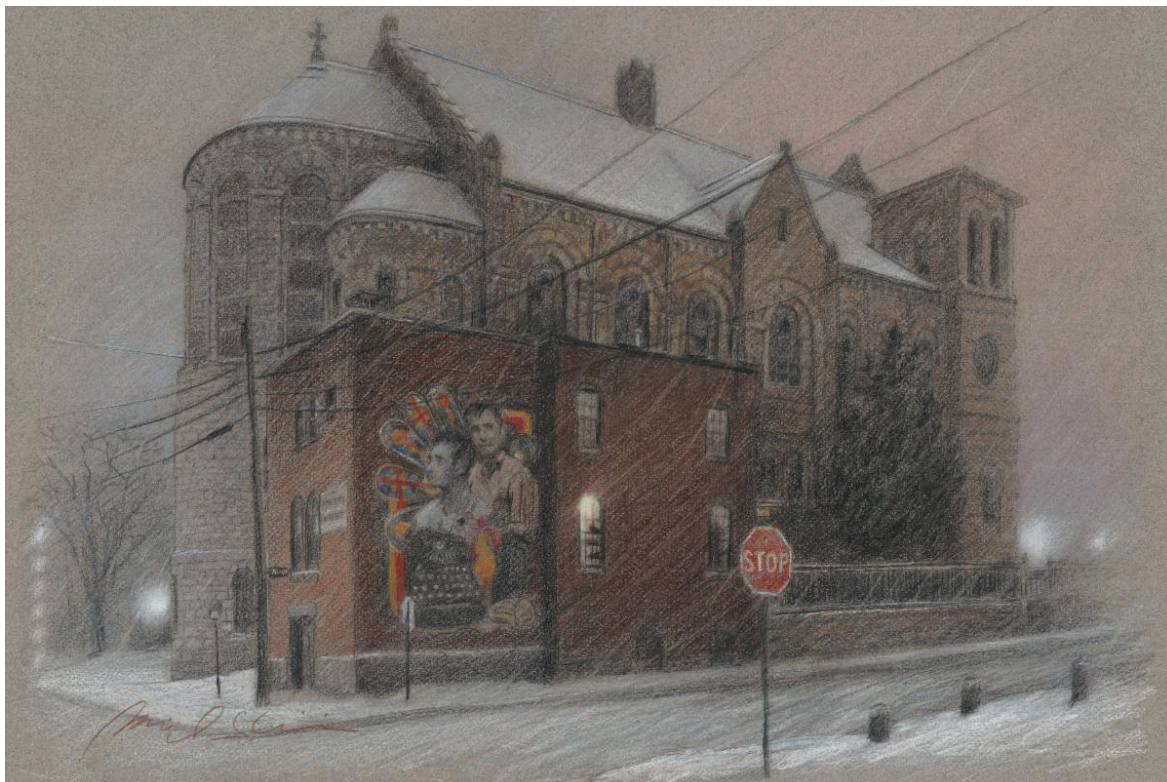
Michael Vieira, Kerouac (My City) , colored pencil & graphite on paper

Exhibition: September 12 - November 3, 2024 Opening Reception: September 14, 2024 from 3 - 6 pm