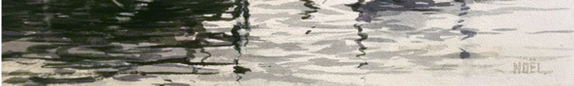
Paul Noël, Returning Gondolier , watercolor on paper, 10.5 x 13.5 in.